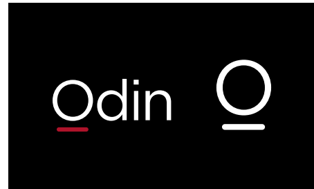
Full color for black/dark backgrounds