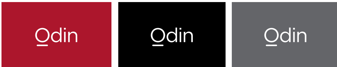
1 color version for red, black, medium grey or dark backgrounds